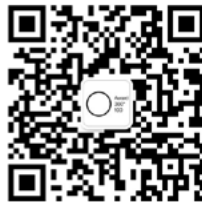
WeChat Contact for Inquiries